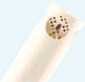
10-90 %RH Element with Thermistor Temperature Sensor