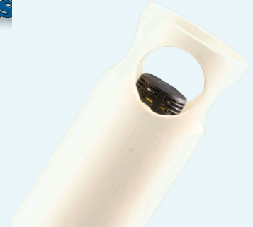
10-95 %RH Element