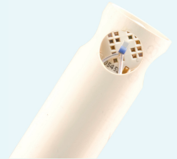
10-90 %RH Element with RTD Temperature Sensor